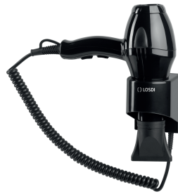
REF: CM-0322 Colour: BLACK